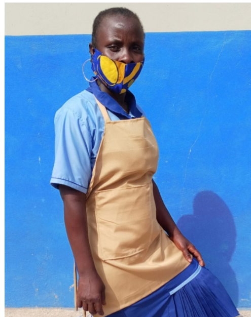
Proposed School Uniform